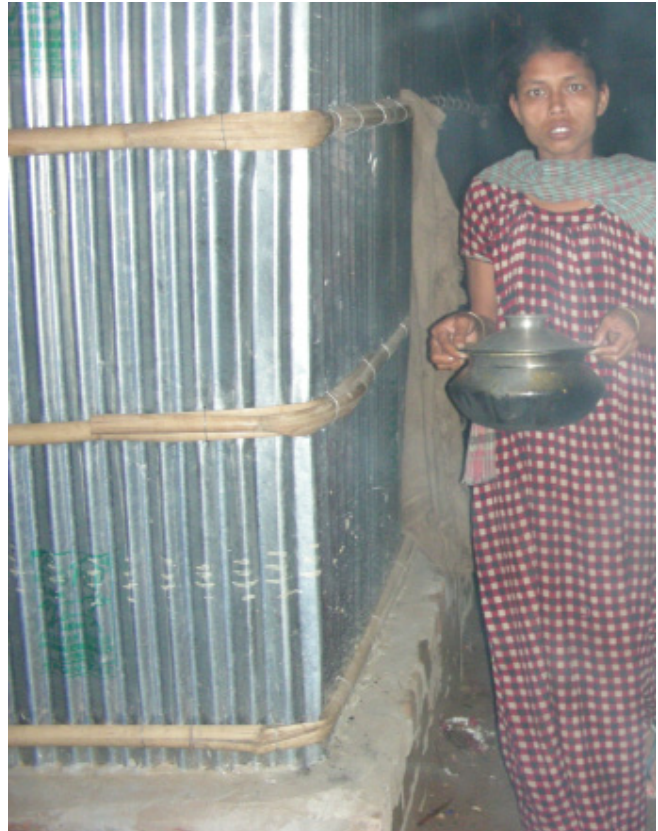
A garment worker carries a pot of food outside her home.