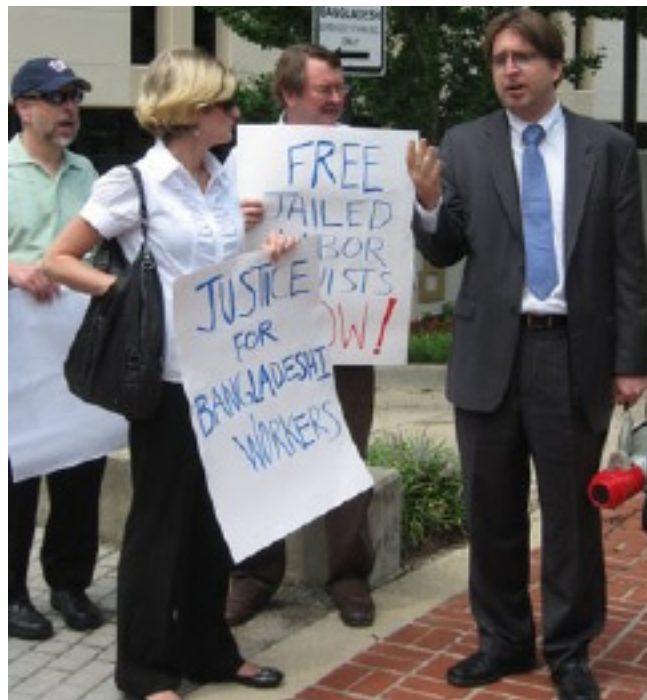
Labor activists rally in front of the Bangladeshi Embassy in Washington, DC, in support of the Bangladesh Center for Worker Solidarity.