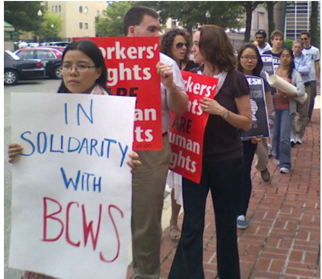
Labor activists rally in front of the Bangladeshi Embassy in Washington, DC, in support of the Bangladesh Center for Worker Solidarity.

When the Government of Bangladesh launched the campaign against BCWS, arrested its leaders, and falsely charged them with participating in and fomenting worker unrest and violence, the international community of labor rights and human rights advocates responded rapidly. Labor rights groups launched urgent action alerts in the United States, Canada, and across Europe. Human Rights Watch wrote a well-publicized letter of protest to Prime Minister Hasina of Bangladesh and Amnesty In-