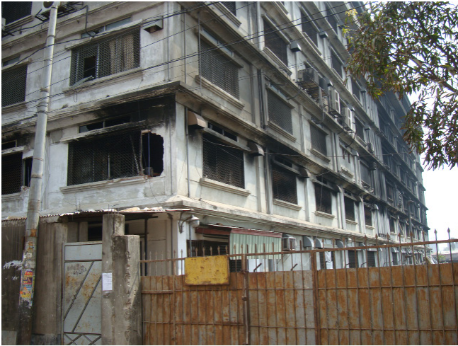
The fire started on the first floor of the Garib & Garib factory.

the Labor and Employment Ministry, the Bangladesh Garment Manufacturers and Exporters Association (BGMEA), and the Bangladesh Knitwear Manufacturers and Exporters Association. An official in the Prime Minister's office observed that "the WWC is a substitute for the trade union as lack of any representation from RMG workers in their working places causes much frustration among them, which sometimes bursts into violence." 19