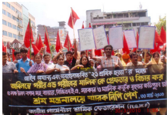
Garment workers protest factory fires and call for safe and healthy working conditions with decent wages. Photo: NGWF, March 30, 2010.

The first minimum wage for garment workers, established in 1985, was only 621 taka ($9) per month. 13 Five years earlier, in 1980, Bangladesh had adopted the Foreign Private Investment Promotion and Protection Act, establishing export-processing zones (EPZs) to stimulate rapid export growth. The Bangladesh Export Processing Zones Authority (BEPZA) was granted immunity from 16 laws relating to industry, labor, and customs issues, including the Industrial Relations Ordinance of 1969 which guarantees workers freedom of association. Instead, special "instructions" gave workers in the export-processing zones the right to be paid the minimum wage for a 48-hour work week, receive a 10 percent annual increase in gross wages, and take a certain number of days off from