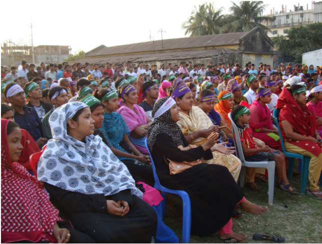
BCWS's daily work involves educating garment workers about their rights. This audience gathered to hear from BCWS on International Women's Day, March 8, 2010.

as criminals and troublemakers in the media. 7