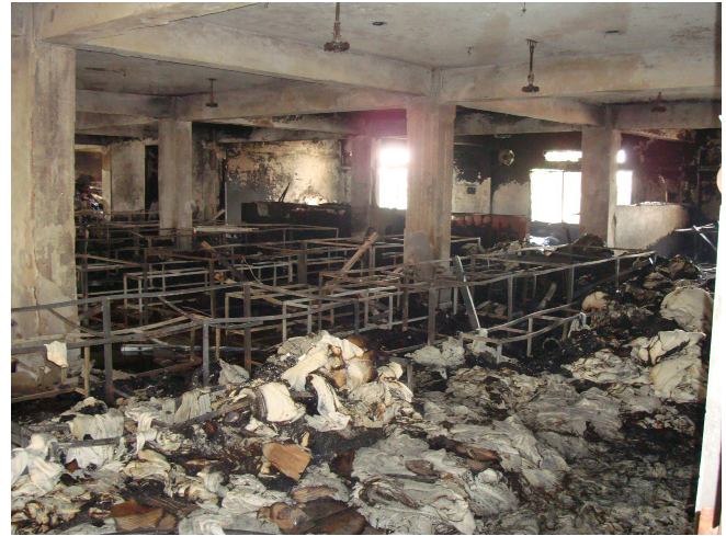
All the workstations and goods on the first floor of Garib & Garib were completely destroyed by the fire.

However, the roots of worker "frustration" are not addressed effectively by worker welfare committees, which have no power to represent workers' genuine interests or negotiate improved wages, benefits, or workplace conditions. While trumpeting the ability of the new workers' welfare committees to "address the legitimate problems of garment workers," 20 Abdus Salam Murshedy's BGMEA also insisted on continued poverty wages for the garment workers, suggesting they should be raised a mere 200 taka, from 1,662.50 taka (US$24) to 1,969 taka per month, at a time when the workers demanded 5,000 taka. 21 Nor would the worker welfare committees be able to organize worker actions to ensure compliance with wage laws. According to a June 2010 Bangladesh Fac-