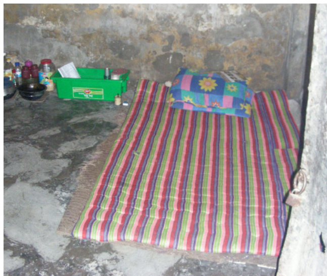
A thin mattress on the floor serves as a worker's bed.

The board met for the first time on January 24, 2010, but without a representative of the factory owners. Workers criticized factory owners for deliberately delaying the implementation of a new minimum wage. 32 When the owners finally joined the board on April 28, their opening offer was 1,875 taka, an increase of only 200 taka (US$3) per month. In May, they increased their offer to 2,000 taka, slightly above the 1,969 taka proposed by the Bangladesh Garment Manufacturers and Exporters Association (BGMEA). 33 Employers argued that they were squeezed by a slump in prices on the international market due to the global economic crisis and by higher production costs because of an energy crisis and poor infrastructure. 34 In June, media reported that