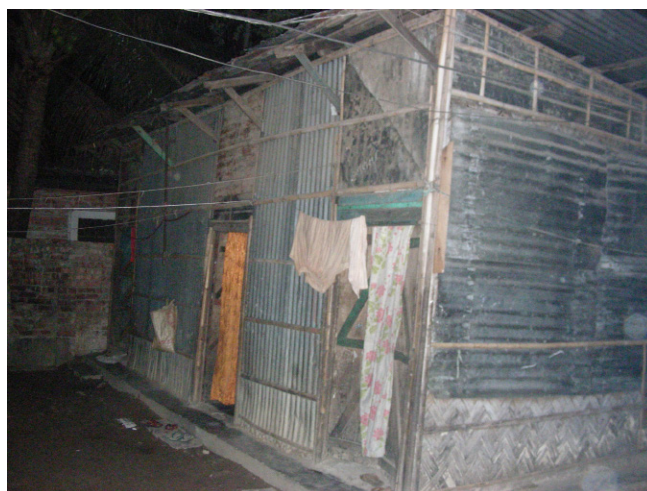
A garment worker's home, made from scrap metal and wood.

“panic gripped the country's 4,500 garment manufacturers” as unions threatened a nationwide non-stop protest for the 5,000 taka minimum wage. 35 But owners stuck to the position that depressed prices, caused by global recession, and production losses, caused by a gas and electricity supply crisis, made it impossible for them to make any substantial increase in workers' wages. The owners insisted they could go no higher than 2,500 taka (US$36) per month and still maintain competitiveness. 36