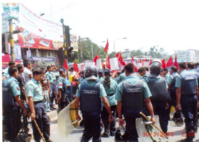
Police presence at the rally where the National Garment Workers Federation demonstrates its outrage at the malpractices which caused 21 workers to die in the Garib & Garib fire. Photo: NGWF, March 30, 2010.

On July 21, the Prime Minister Sheikh Hasina weighed in on the wage debate with a speech in Parliament, terming garment workers' wages "not only insufficient but also inhuman" and observing that "workers cannot even stay in Dhaka with the peanuts they get in wages." Raising the hopes of garment workers, the prime minister argued that owners should also give a portion of their profits to the workers for