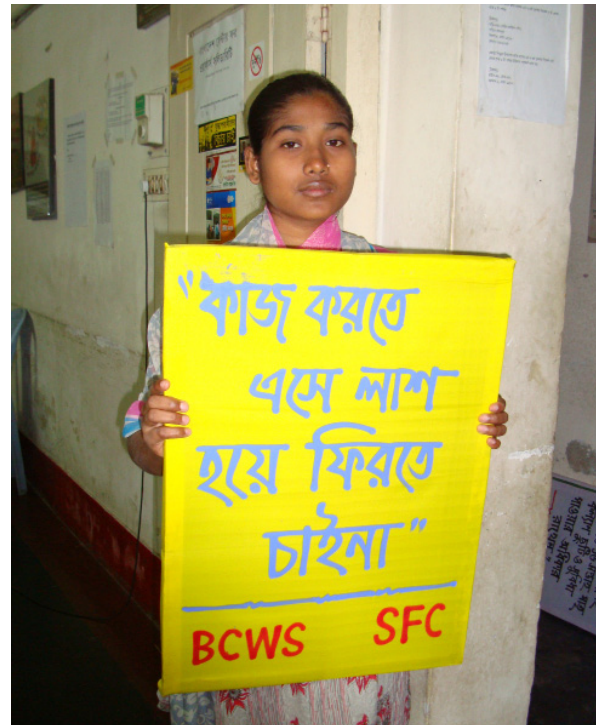
BCWS advocates for just restitution for the families of factory fire victims. This young garment worker holds a sign that reads: “Came to work. Don’t want to go back as dead body.”